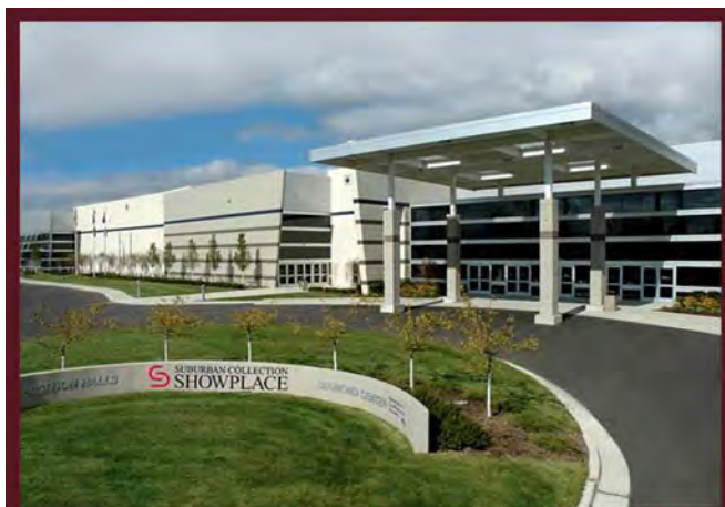
The chosen JAINA Convention facility (SCS) in Metro Detroit.

Mark your calendars and stay tuned for further updates and Convention-related mailings. Early-bird registration will open in November 2012 during Diwali week. For more information about Convention-related developments, visit www.JAINA.org .