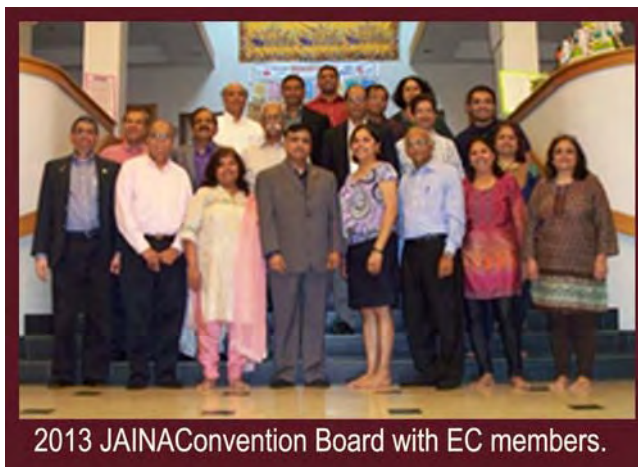
2013 JAINA Convention Board with EC members.