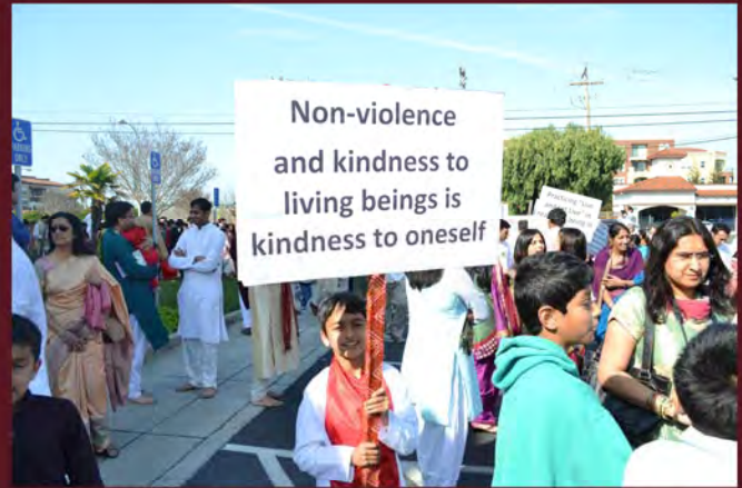
Badi Diksha Vargodha scene in Northern California