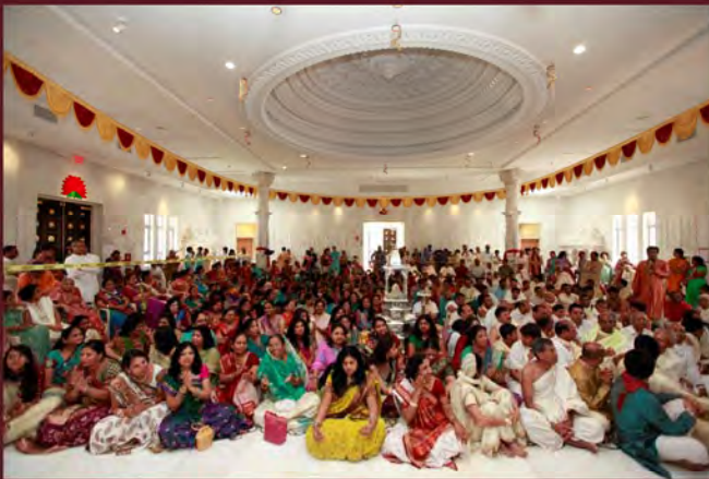
Pratihtha Mahotasav - Franklin Township, NJ

A picture from the JAINA Tirth Yatra Temple Book, published by the JAINA Calendar & Mini Library Committee