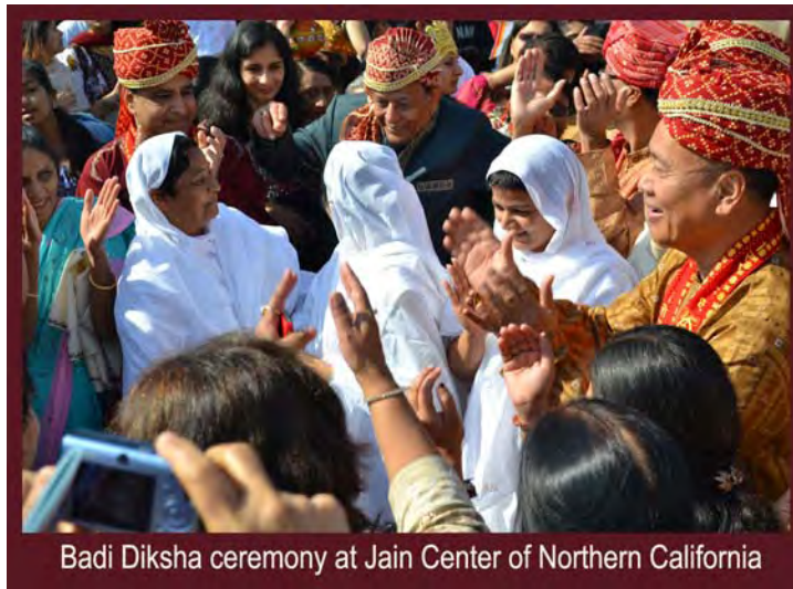
Badi Diksha ceremony at Jain Center of Northern California