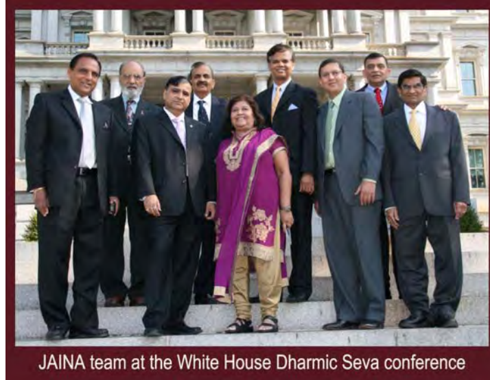
JAINA team at the White House Dharmic Seva conference

beliefs such as non-violence, respect for all life, tolerance for multiple viewpoints and compassion. JAINA and other delegates went back with the