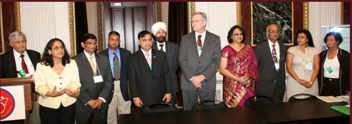
White House Conference on Dharmic Seva - Members of Different Asian Religious Faiths (Dharmic Faiths)