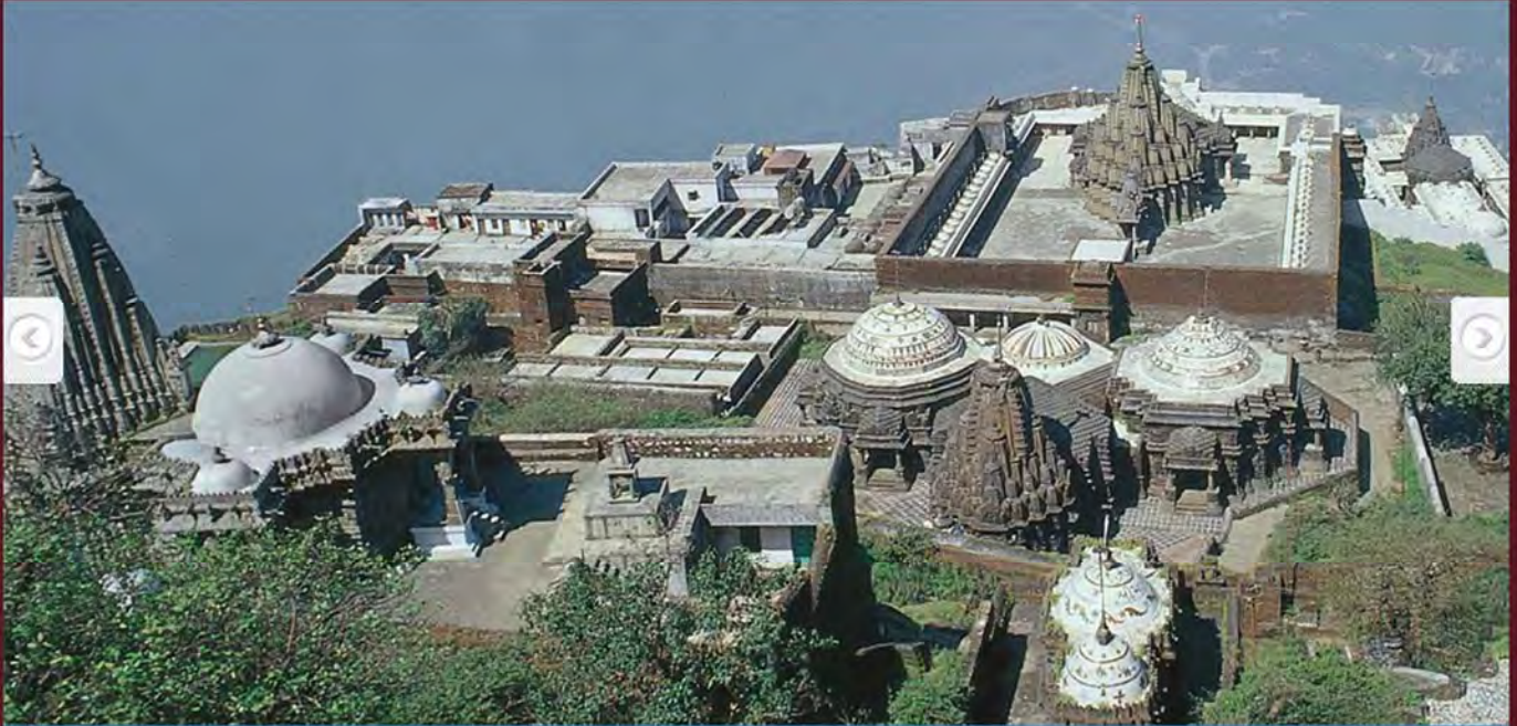
Mount Girnar - Neminath Temple - Gujarat